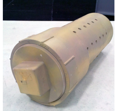
clean out drain cap