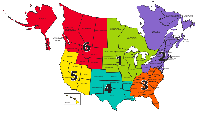
BARN HUNT REGIONS

Unless otherwise outlined in this document, all regular Barn Hunt Association rules apply at Regionals.