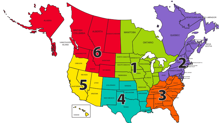
BARN HUNT REGIONS